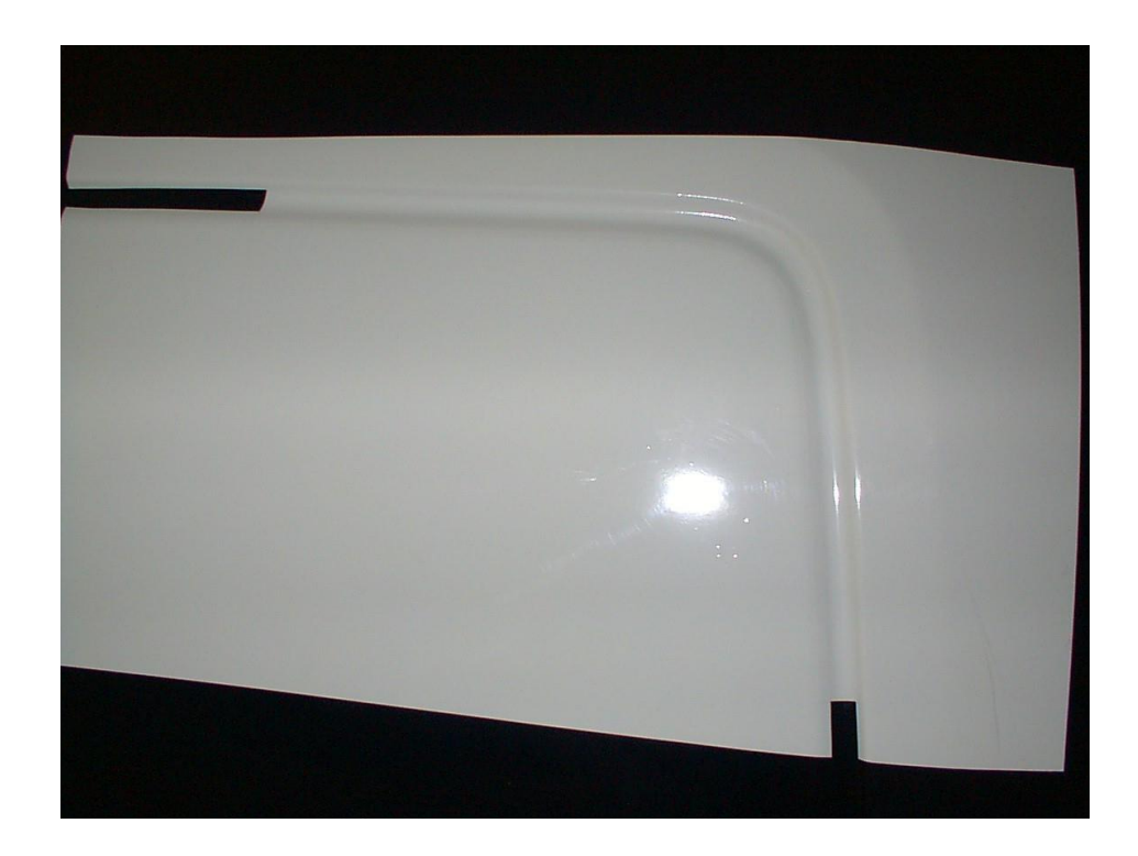
Illustration of a completed recess corner. Some material has been removed from the recess for clarity.

• Apply VWS to the flat panels and cut to overlap the edges of the vinyl in the recesses. Use gentle heat if necessary on the corners. This application method hides the joint line from view and ensures that the vinyl remains in the recesses.